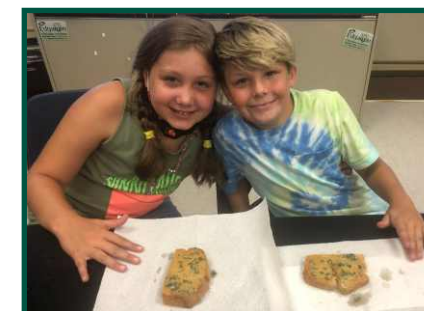
It Takes Two, Junior Eagle & Eagles, Aug. 2-6