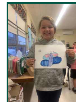
Birds, Bugs & Butterflies, All Groups, July 5-9